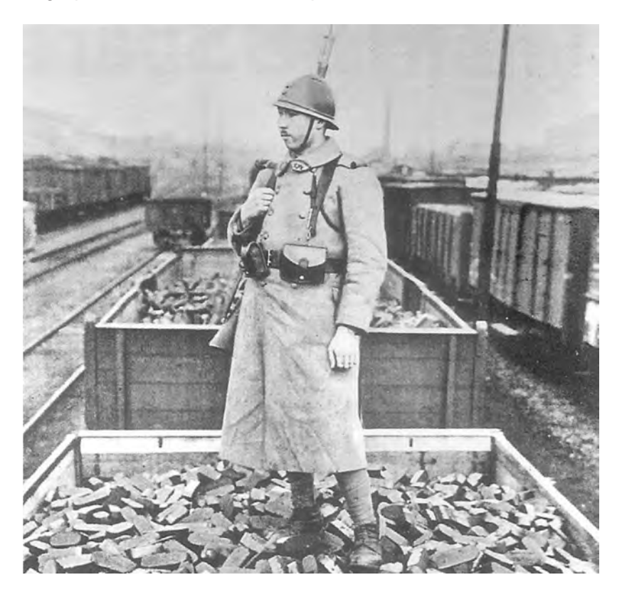
A photograph of a French soldier guarding a train in the Ruhr, 1923.

9 Look at the photograph, and then answer the questions which follow.