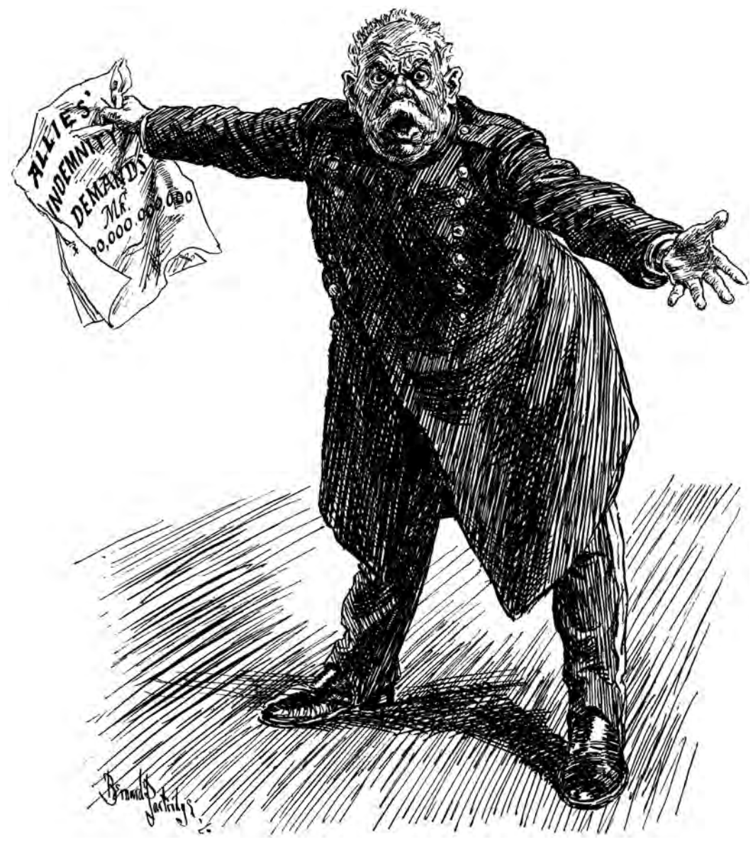
THE RECKONING. PAN-GERMAN: "MONSTROUS, I CALL IT, WHY, IT'S FULLY A QUARTER OF WHAT WE SHOULD HAVE MADE THEM PAY, IF WE'D WON."

5 Look at the cartoon, and then answer the questions which follow.